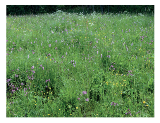
Fig. 14.1.4. Moist variant of the habitat type 6270* Fennoscandian lowland species-rich dry to mesic grassland.