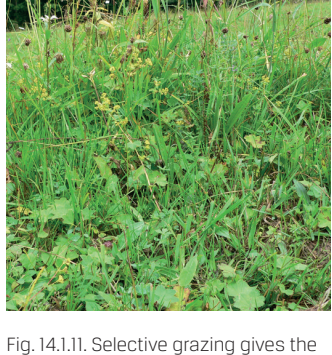
Fig. 14.1.11. Selective grazing gives the plant species the chance to bloom and shed seeds in some places.

In Latvia the habitat has usually developed in ex-arable land in mesic soils after the commencement of grazing. Historically, the moist variant of the habitat type has also developed under the influence of wild animal or livestock grazing and mowing in fens and moist forests. Moderate drainage using