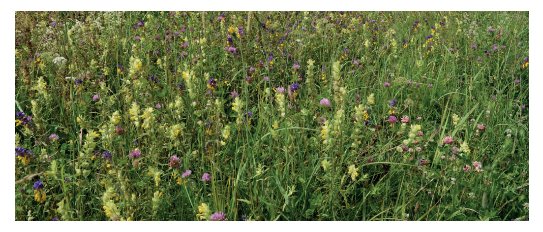
Fig. 14.1.10. A grazed meadow with high species density, blooming before it will be mown.

moist areas also Holcus lanatus, Cynosurus cristatus and Deschampsia cespitosa ). Tall herbaceous plant layer is almost absent or very sparse (consisting of some tall grasses with low abundance, for example, Helictotrichon pubescens, Festuca pratensis.