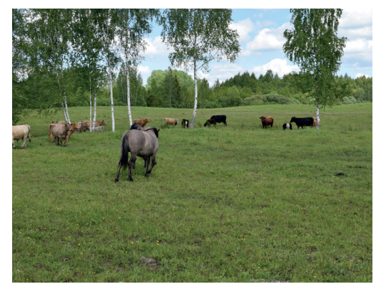
Fig. 14.1.5. Moist variant of the habitat type 6270* Fennoscandian lowland species-rich dry to mesic grassland in Jaunpiebalga Municipality.