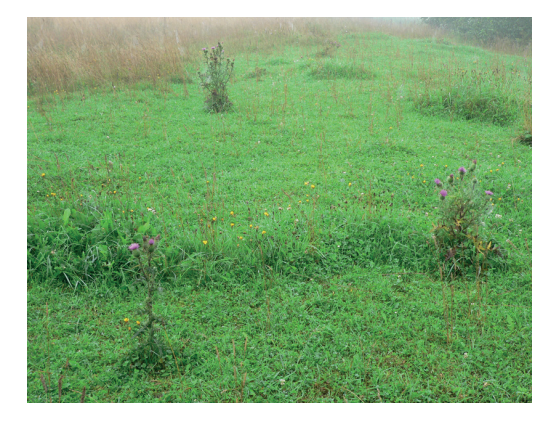
Fig. 14.1.6. Pasture vegetation structure. Cirsium vulgare is desirable in small amounts because its seeds in winter are food for birds, but it can proliferate excessively and outcompete other species, therefore its spread should be controlled.