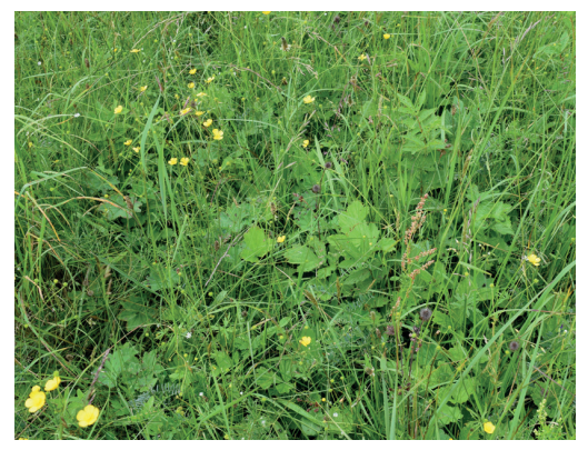
Fig. 14.1.9. The lowest layer of vegetation is best developed in species-rich pastures. Moist pastures are often dominated by Geum rivale .