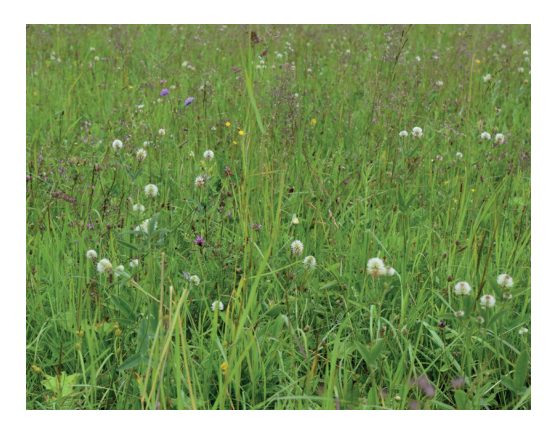
Fig. 14.1.8. Species-rich pastures have very many species even in a small area.