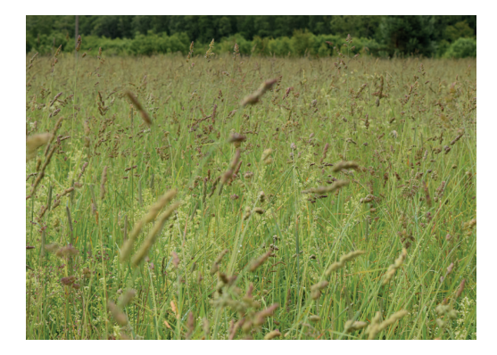
Fig. 14.3.2. Tall and thick vegetation of cultivated grassland indicates high soil fertility, therefore restoration of seminatural grassland will be complicated. Photo: S. Rūsiņa.

Fig. 14.3.1. The moist variant of species-rich pastures and grazed meadows overgrown with Filipendula ulmaria with open ditches in a drained floodplain. Dominance of Filipendula ulmaria indicates that the moisture conditions are still suitable for the moist variant of the habitat and the filling of ditches is not required for restoration. Photo: S. Rūsiņa.