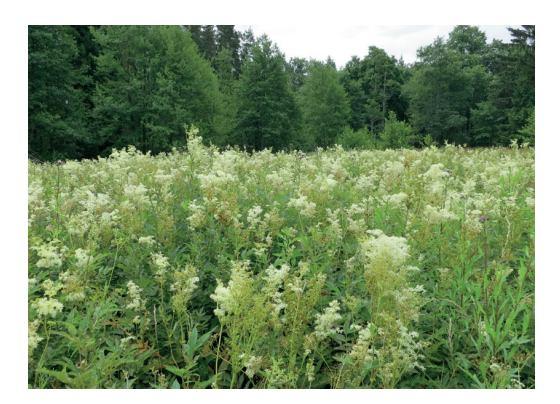
Fig. 14.3.1. The moist variant of species-rich pastures and grazed meadows overgrown with Filipendula ulmaria with open ditches in a drained floodplain. Dominance of Filipendula ulmaria indicates that the moisture conditions are still suitable for the moist variant of the habitat and the filling of ditches is not required for restoration.