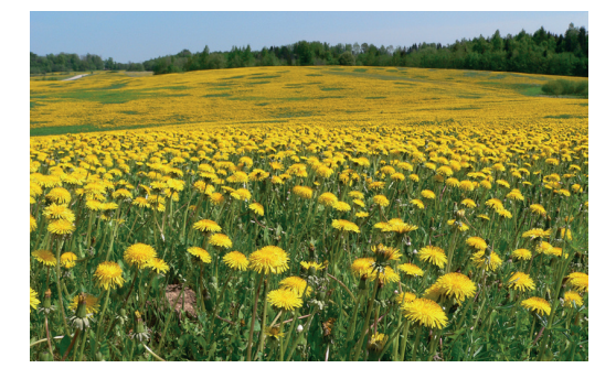
Fig. 14.3.4. Although grass yield in such ex-arable land is not high, the dominance of Taraxacum officinale indicates that the soil is fertile and restoration of semi-natural grassland requires nutrient removal. Otherwise the semi-natural grassland species will not be able to compete with the dandelion and other nitrophilous species.

tent of the transformation of the grassland. There are a number of situations depending on the type of restoration and difficulty level.