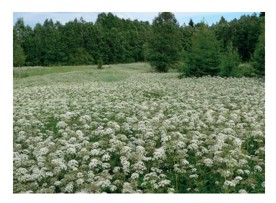
Fig. 14.3.3. Former arable land overgrown with Aegopodium podagraria . Restoration of species-rich pasture or grazed meadow is complicated because topsoil needs to be removed to strip nutrients and eliminate the highly competitive ground elder. Photo: S. Rūsiņa.

Fig. 14.3.2. Tall and thick vegetation of cultivated grassland indicates high soil fertility, therefore restoration of seminatural grassland will be complicated. Photo: S. Rūsiņa.