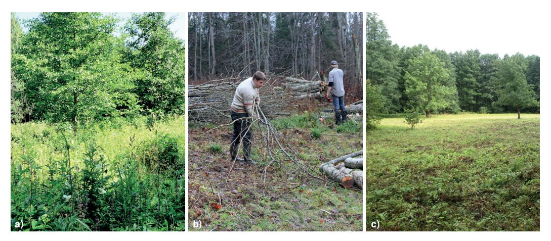
Fig. 14.5.1. Restoration of Dāvidpļava meadow. ( a ) Before restoration, ( b ) clearing of shrubs, ( c ) after restoration.

expansive plant species is decreasing (Fig. 14.5.1–14.5.2).