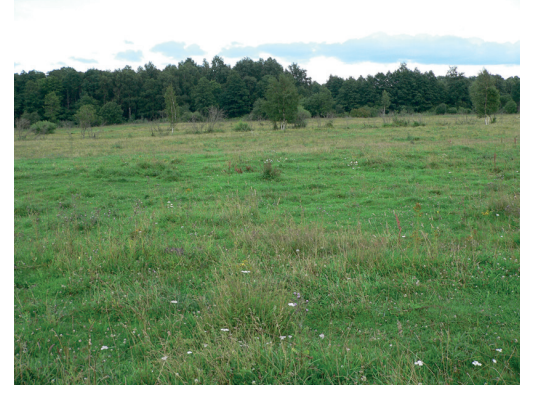
Fig. 14.1.7. Pasture vegetation structure is characterised by intensively grazed areas with low grass and less-grazed areas with taller grass.