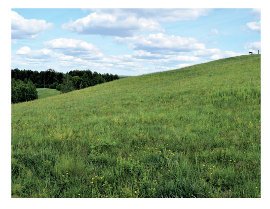
Fig. 14.1.2. Typical variant of the habitat type 6270* Fennoscandian lowland species-rich dry to mesic grassland near Druskas hillfort in Korneti.

Chapter 14 6270* Fennoscandian lowland species-rich dry to mesic grasslands (S. Rūsiņa, A. Auniņš, V. Spuņģis)