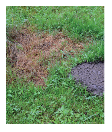
Fig. 14.1.12. Uneven distribution of animal excrement creates the diversity of vegetation structures.