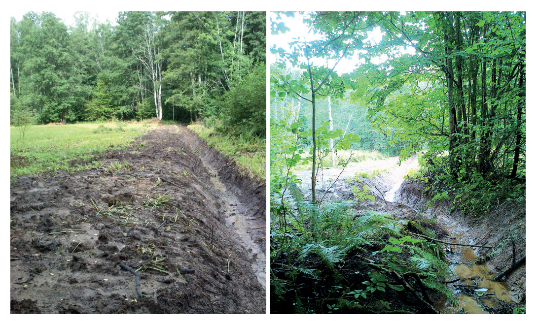
Fig. 14.5.2. A shallow ditch hand-dug in the first half of the 20th century is cleaned in Dāvidpļava. The removed soil has been spread out along the edge of the ditch. The vegetation there will recover in a few years.

Fig. 14.5.1. Restoration of Dāvidpļava meadow. ( a ) Before restoration, ( b ) clearing of shrubs, ( c ) after restoration.