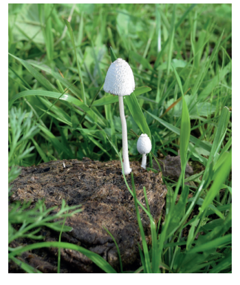
Fig. 14.1.13. Animal excrement in pastures is a habitat for various fungi and a habitat and feeding place for invertebrates.