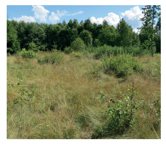
Fig. 14.3.6. Abandoned species-rich pasture that is easy to restore. All species characteristic of semi-natural grassland still occur there.

No research on the optimum groundwater table in grasslands of the moist variant of the habitat type has been conducted in Latvia. Research elsewhere in Europe shows that it should be ap-