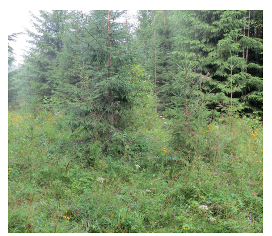
Fig. 14.3.7. Abandoned species-rich pasture that is easy to restore.