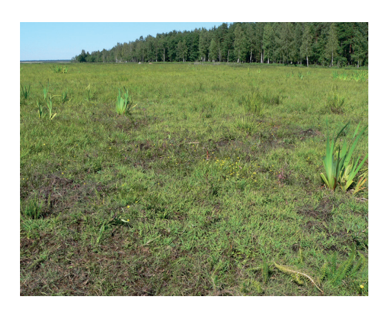
Fig. 15.1.13. In terms of botanical and entomological diversity conservation, an overgrazed Molinion grassland in the "Engures ezers" Nature Park, pasture on the east shore of Lake Engure (3 August 2011).

Favourable condition is indicated by the presence of umbrella species – plant species adapted to alternately moist conditions, for example, Carex panicea , C. flacca , C. hartmanii , Sesleria caerulea , Molinia caerulea , Ophioglossum vulgatum , Polygala amarella – and rare species such as Primula farinosa , Gymnadenia conopsea , Orchis mascula and bird and invertebrate communities, especially the presence of whorl snails Vertigo spp. ( see Chapter 15.1.2 ).