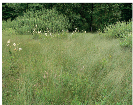
Fig. 15.1.14. Molinion grassland paludified due to the influence of a long-term beaver impoundment as evidenced by the dominance of Carex lasiocarpa in the vegetation.

Mowing time should be adapted to moisture conditions. Mowing should be done in the driest period of summer. In wetter sites, it is recommended to use "floating" machinery that is suitable for