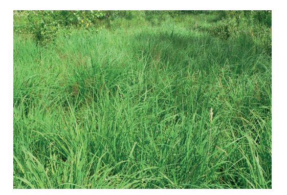
Fig. 15.1.11. Due to drainage, Molinia caerulea has become expansive and forms an almost monodominant stand.