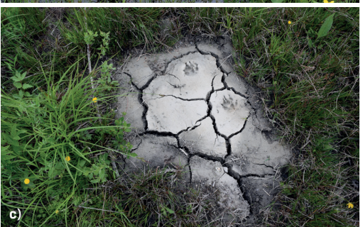
Fig. 15.1.7. The habitat is periodically water-logged, or dry. (a) Sesleria variant of Molinion grassland in "Diļļu Pļavas" Nature Reserve in December 2015, (b) Ķemeri National Park on 21 May 2015, (c) "Kuja" Nature Park on 25 May 2016.

grasslands most significantly. Arable land or improved grasslands have been created in many drained areas. Grasslands drained using only shallow ditches are an exception. They mostly preserve the species composition and structure characteristic of the habitat.