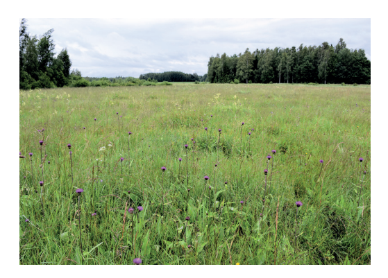
Fig. 15.3.1. A habitat in a favourable condition in the floodplain of the River Taleja. There are many forb species, expansive species are absent.