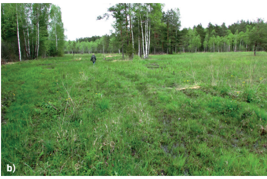
Fig. 15.5.5. The restored grassland in Čaukciems meadows in Ķemeri National Park. (a) Ground site a few days after the completion of work (January 2013). (b) In May 2015 the ground areas were covered by vegetation that only remained sparse in some places. Tussocks have been smoothed by grinding, there is almost no deciduous tree and shrub regrowth at all. Vegetation recovers successfully. Unfortunately, whorl snails were not studied before or after restoration, so there is no information about the impact of restoration on them.