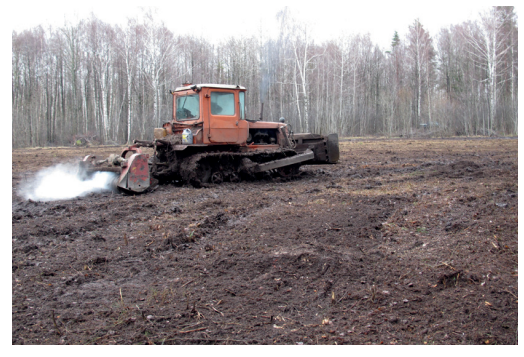
Fig. 15.5.2. Grinding of grassland in Čaukciems meadows in Kemeri National Park in January 2013. Shrubs and separate trees were cleared and removed before grinding, except for older tree clusters and some individual trees. In grinding, "islets" of vegetation around tree clusters were left. Grinding was done in the snow-free period when the ground was not frozen.