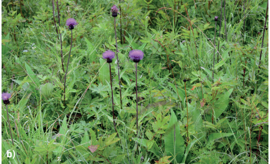
Fig. 15.1.6. (a) Vegetation can be very small-leaved or narrow-leaved if it is dominated by sedges and rushes – Carex panicea , C. hartmanii , and Juncus conglomeratus creates the bluish shade of vegetation, or (b) markedly broad-leaved if dominated by forbs – Cirsium heterophyllum , Trollius europaeus , and Filipendula ulmaria .

dominant stands of Carex hostiana and C. buxbaumii in some places. When woody species get established, grassland mainly overgrows with Salix spp. (in coastal areas of western Latvia also with Myrica gale ), later also with Betula spp. and Alnus glutinosa . Due to periodically wet conditions, especially in