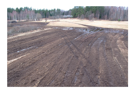
Fig. 15.5.3. In moist areas, grinding can also be done when the soil is not frozen; use of a tracked tractor has an especially low impact.