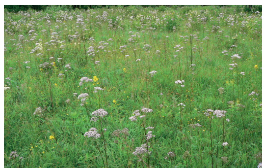
Fig. 15.1.5. In Slitere National Park, the Molinion grasslands occur in small glades.