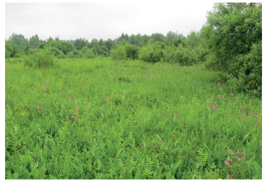
Fig. 15.1.10. An abandoned Molinion grassland overgrowing with Salix spp.