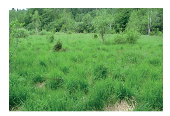
Fig. 15.5.1. Vegetation structure (tussocks, a lot of litter) in a Molinia variant that has not been managed for a long period of time (approximately 40 years) in Čaukciems meadows in Ķemeri National Park. Clearing of shrubs, smoothing of tussocks and grinding of shrub roots to prevent regrowth was required to prepare the grassland for management.