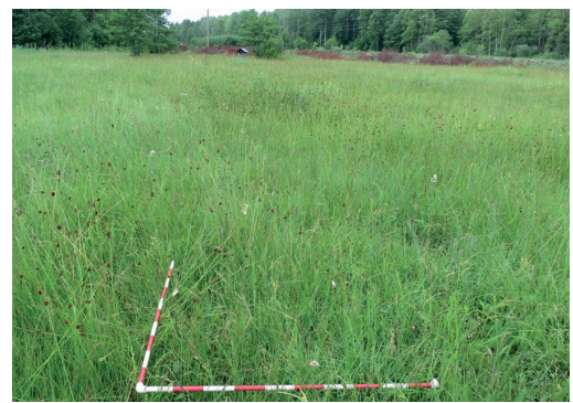
Fig. 15.3.2. In the sedge variant of the habitat type (6410_3) in favourable condition, the species diversity is not as high as in other variants, determined by the relatively stronger and longer period of moist conditions, therefore there are few blooming forbs.