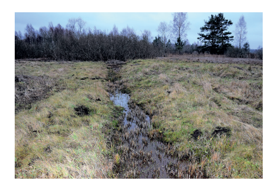
Fig. 15.3.5. A shallow ditch in a grassland in "Diļļu Pļavas" Nature Reserve (December 2015). Vegetation fully corresponds to Molinion grassland. If the ditch ceases to function, paludification is likely to occur, so a shallow drainage system should be maintained.

le nitrogen, which leads to reduced species diversity. Rewetting in the long term reduces the content of nitrogen, but releases phosphorus (Klimkowska et al. 2007). In such cases soil fertility should be reduced by grass mowing with removal at least twice per season in the first years. If the soil is very rich in phosphorus, then fertility reduction by deturfing or other methods is desirable before rewetting (see Chapter 21.6) (Tallowin, Smith 2001).