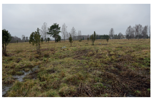
Fig. 15.1.3. The northern part of "Diļļu Pļavas" Nature Reserve (Alsunga Municipality) is the only area where this habitat is currently managed within a nature reserve. Photo: S. Rūsiņa (December 2015).