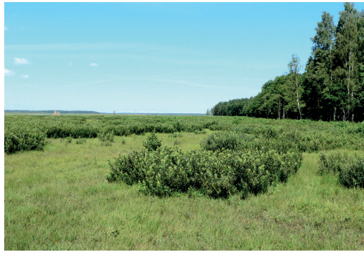
Fig. 15.1.12. Expansion of Myrica gale in Molinion grassland in "Engures ezers" Nature Park, pasture on the east shore of Lake Engure (3 August 2011).

ple, Crex crex ) and species, whose populations in Latvia have been reducing recently ( Motacilla flava, Carpodacus erythrinus (Auniņš, 2016)).