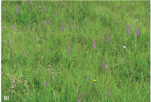
Fig. 15.3.3. A habitat in a favourable condition is a suitable habitat for rare and protected orchid species. (a) Orchis militaris , (b) Gymnadenia conopsea and Epipactis palustris .