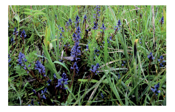
Fig. 15.1.4. Several Molinion grasslands have been restored in Ķemeri National Park in 2014. Sesleria caerulea and Polygala amarella bloom abundantly in spring.