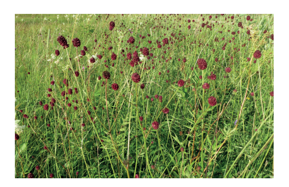
Fig. 15.1.2. "Vītiņu Pļavas" Nature Reserve in Grobiņa Municipality has a rich locality of the protected species Sanguisorba officinalis.