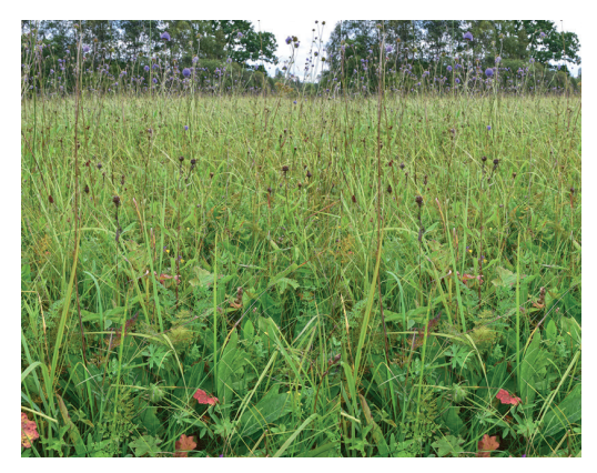
Fig. 15.3.4. Favourable condition is indicated by vegetation structure – it has several layers, where many plant species are distributed evenly.

If the grassland has been drained using deep ditches, rewetting is usually necessary. Drainage causes peat mineralisation and an increase in the bioavailab-