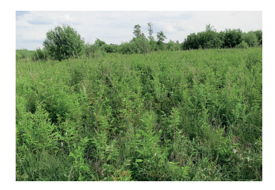
Fig. 15.1.9. An abandoned Molinion grassland overgrowing with Filipendula ulmaria .