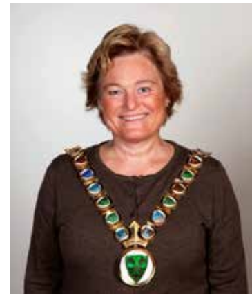
Gro Lundby, Labour Party County Mayor