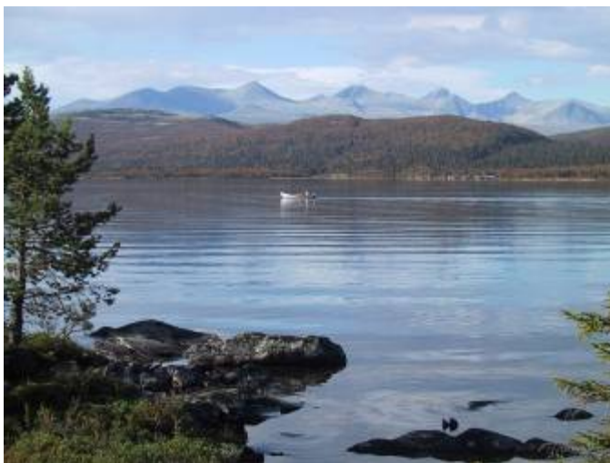
Opportunities in Oppland